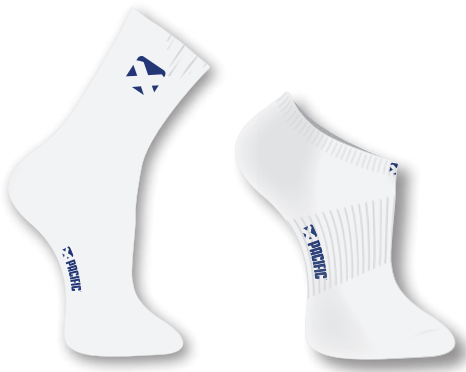
SPORT SOCKS MEN/WOMEN

MEN M (36-42) A155.17 MEN L (40-46) A155.19 WOMEN M (36-40) A170.17