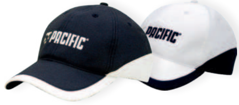
TEAM X CAP