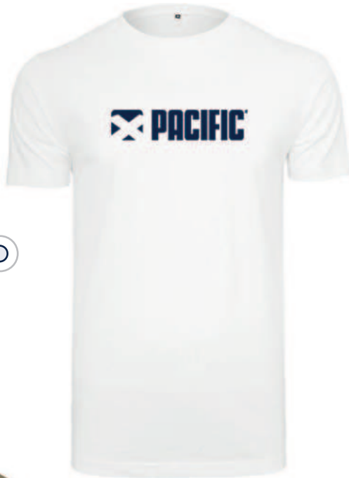
• P526 White White