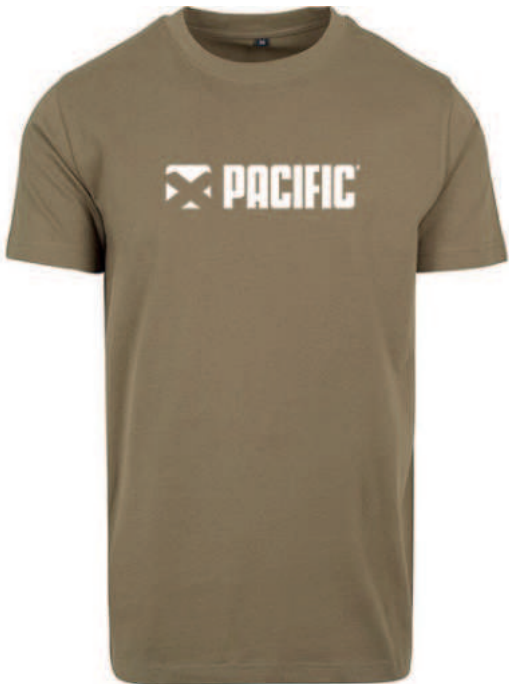
• P524 Olive Olive