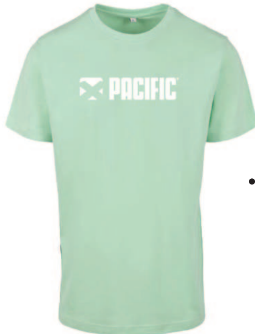
• P525 Mint Mint