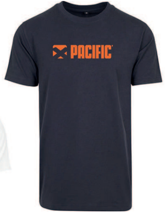
• P523 White Navy